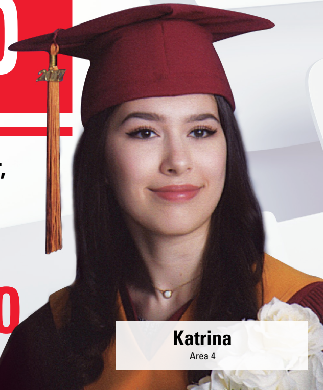
Katrina Area 4